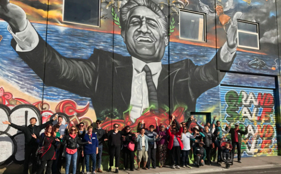
Let's Walk Angliss.